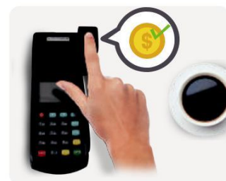
POS Authentication with Fingerprint