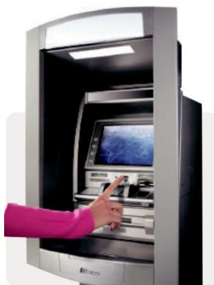
ATM Banking with Fingerprint